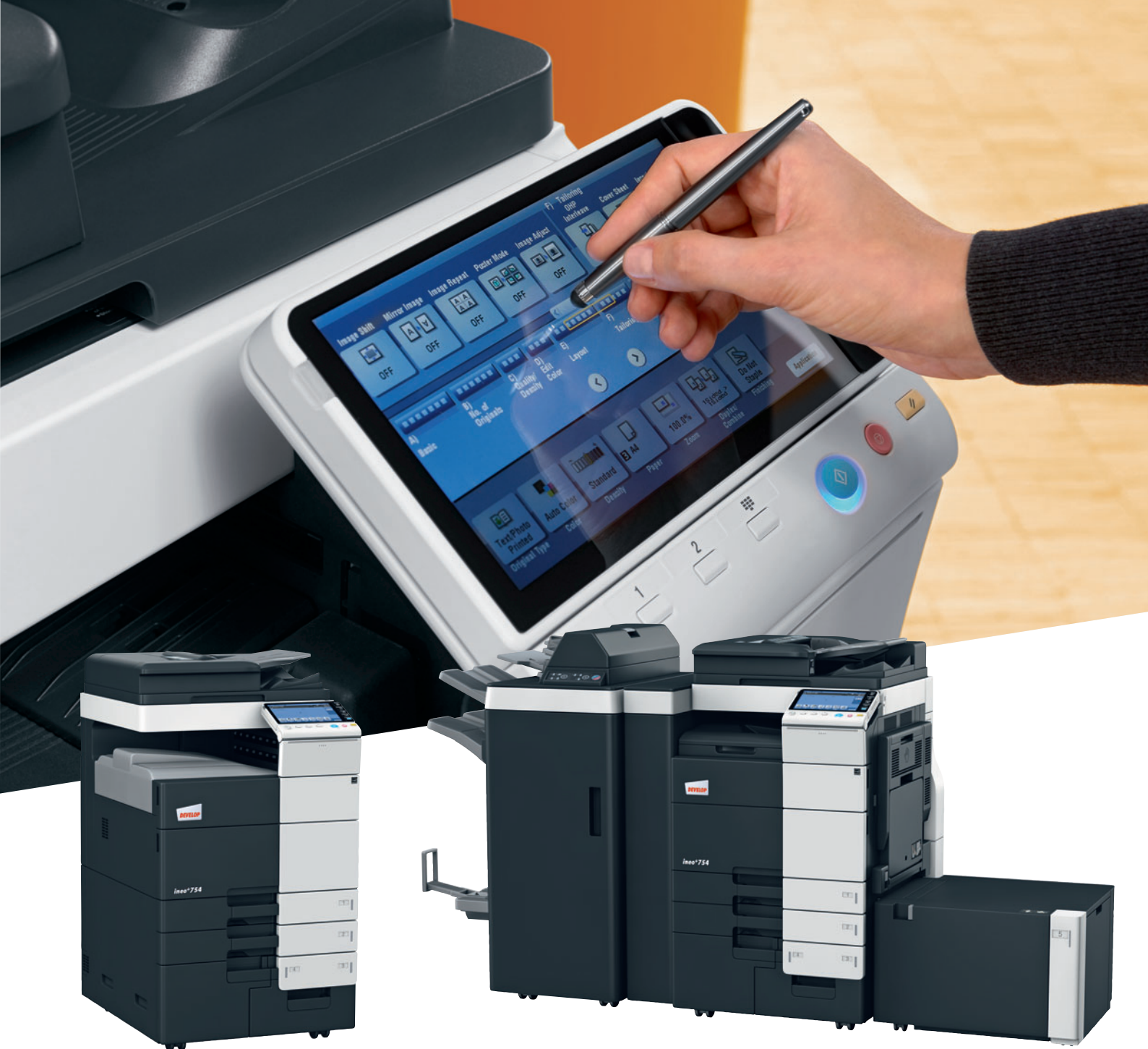
ineo+ 754 with output tray (OT-503)